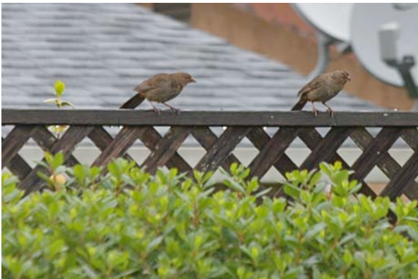
Towhee parents responding to young calling.