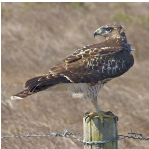
Juvenile Red Tailed Hawk.

Scientific Name: Buteo jamaicensis ( Buteo is Latin for hawk, jamaicensis refers to where the first specimen was collected).