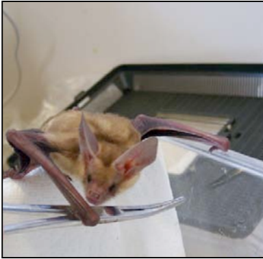
Female Pallid Bat in rehabilitative care with WRCNC staff.