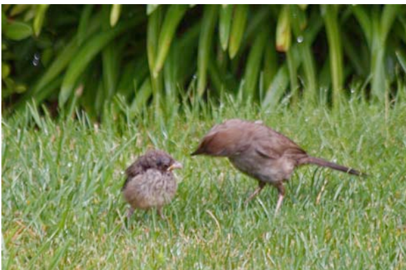
Parent feeding reunited fledgling.